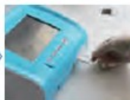
Test card insert