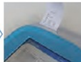
Result printed automatically after reaction