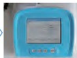
Result printed automatically in 5-8s