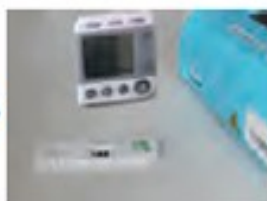
Timing the reaction manually