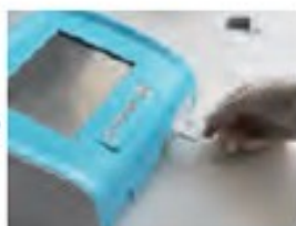
Test card insert